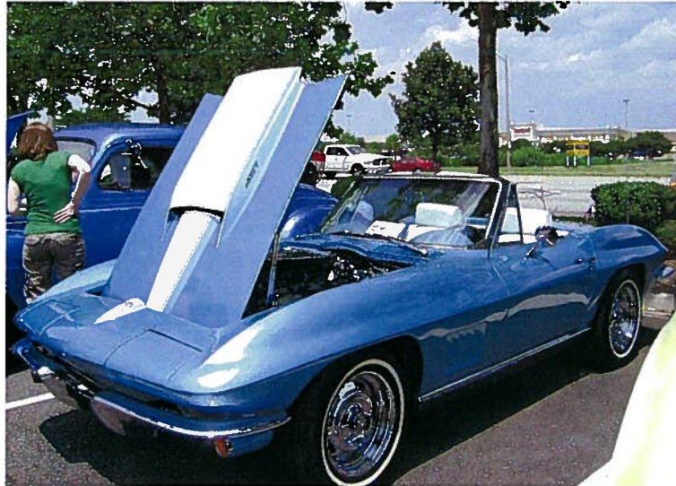
A beauty of a Corvette wins Best Classic at the Lay-Z-Boy show supporting Ronald McDonald House

At 3:15 the drawing for the door prizes was held followed by the awarding of the trophies for People's Choice,