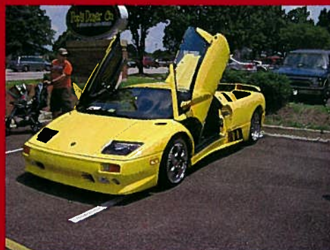
People's Choice went to the Lamborgini..... need we say more? (Yes, we're just jealous!)